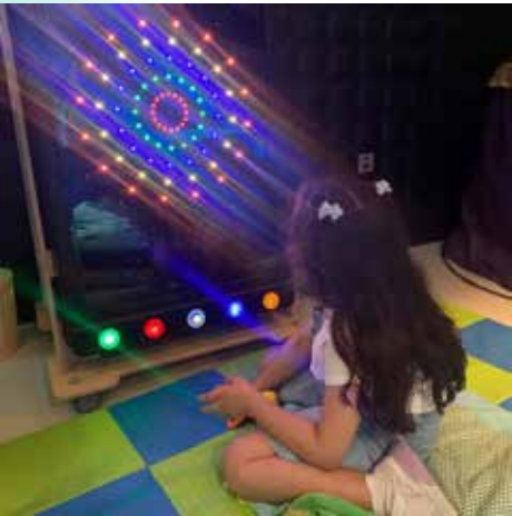
QNL's sensory room offers support for children with special needs.

All of us are different, with different strengths and weaknesses. Diversity and inclusion are at the center of QNL's value system and as such the Library offers workshops, resources, training and events for a wide range of children and adults.