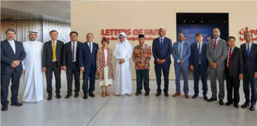
The Letters of Faith exhibition highlighted the shared heritage of Qatar and Indonesia.

Through this experience, visitors were offered an enriching insight into the shared heritage and enduring ties that link these two cultures. The exhibition provided a window into a world where faith, art, and cultural exchange converge, fostering greater understanding and appreciation, and marking a pivotal chapter in the cultural dialogue between Indonesia and the Arab world.