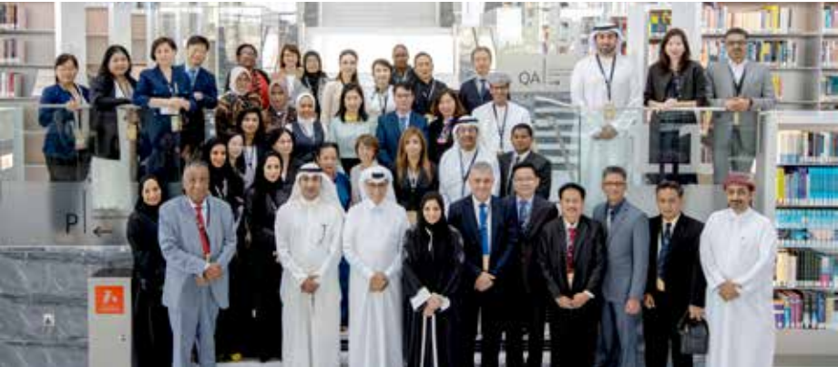
Delegates at the CDNLAO discussed how libraries could represent their communities.

Library executives from around Asia then gathered to network and learn of strategies in cultural preservation and engagement as QNL hosted the 29th Conference of Directors of National Libraries in Asia and Oceania (CDNLAO) . Over the course of the two-day conference, library directors participated in a series of sessions exploring various strategic