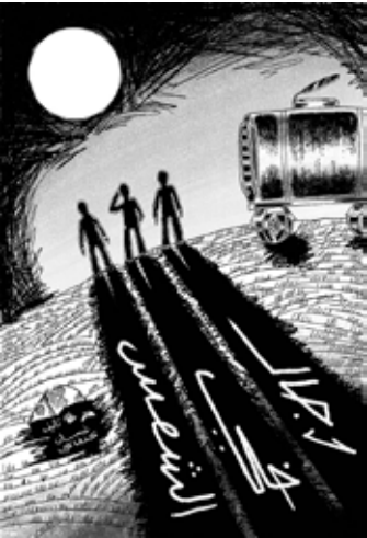
Cover of a new graphic novel adaptation of Men in the Sun .

To further engage the community and support Palestine, Qatar Reads proudly announced that the featured book for next year’s One Book, One Doha campaign would be Men in the Sun by renowned author Ghassan Kanafani.