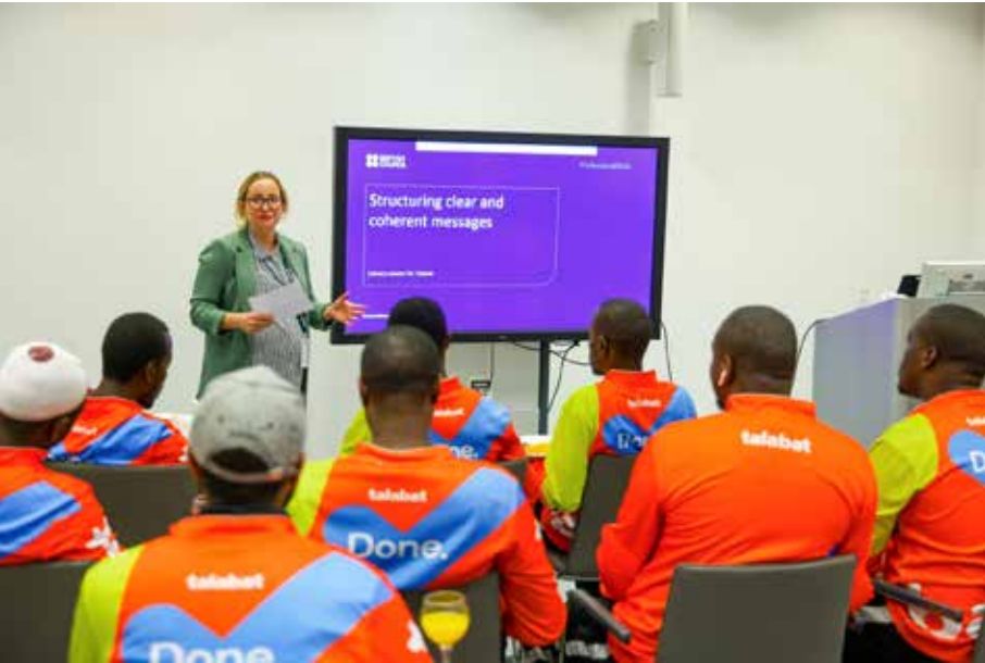
The course for Talabat drivers was developed to help them better communicate with customers.

Over three sessions of the Let’s Speak Arabic classes, 34 people of numerous nationalities came together for the basic course, learning phrases and vocabulary for things like greetings, colors, transportation, numbers, directions and conversational Arabic. Twenty-seven of the people continued onto the two-day advanced course, where they were shown QNL resources that would help them to continue learning Arabic in their leisure time.