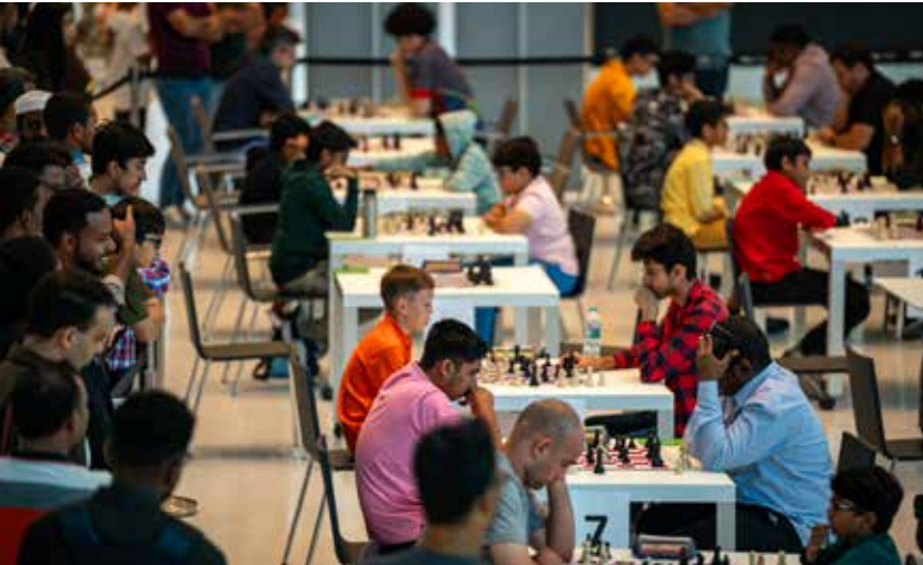
Concentration and tactics were on display at the inaugural Chess Open.