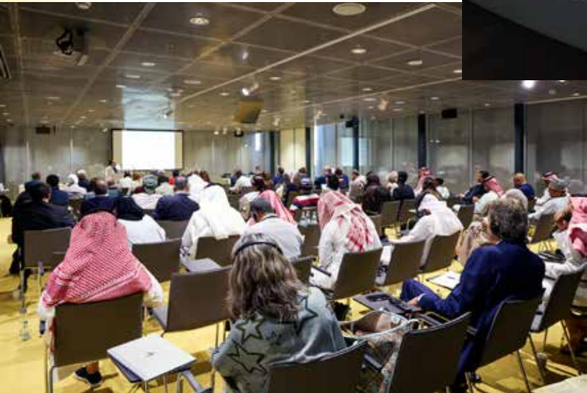
The workshop attracted local and international stakeholders.

The delegates concluded that improved messaging that demonstrates the link between heritage trafficking, terrorism and organized crime would be beneficial, as would field studies for those fighting against trafficking, to better understand the work of judicial systems and archaeologists.