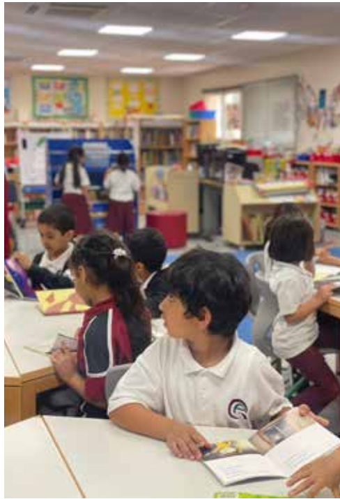
QNL works with schools across Qatar to improve literacy.

In 2023, these included health awareness sessions for students, story-telling events at Qatar Academy – Al Wakrah, and Qatar Academy – Doha, and sessions to inform children and their families of the resources available at the Children's Library. QNL also hosts regular school tours with 281 held in 2023 and more than 8,000 children and their teachers experiencing what the Library has to offer.