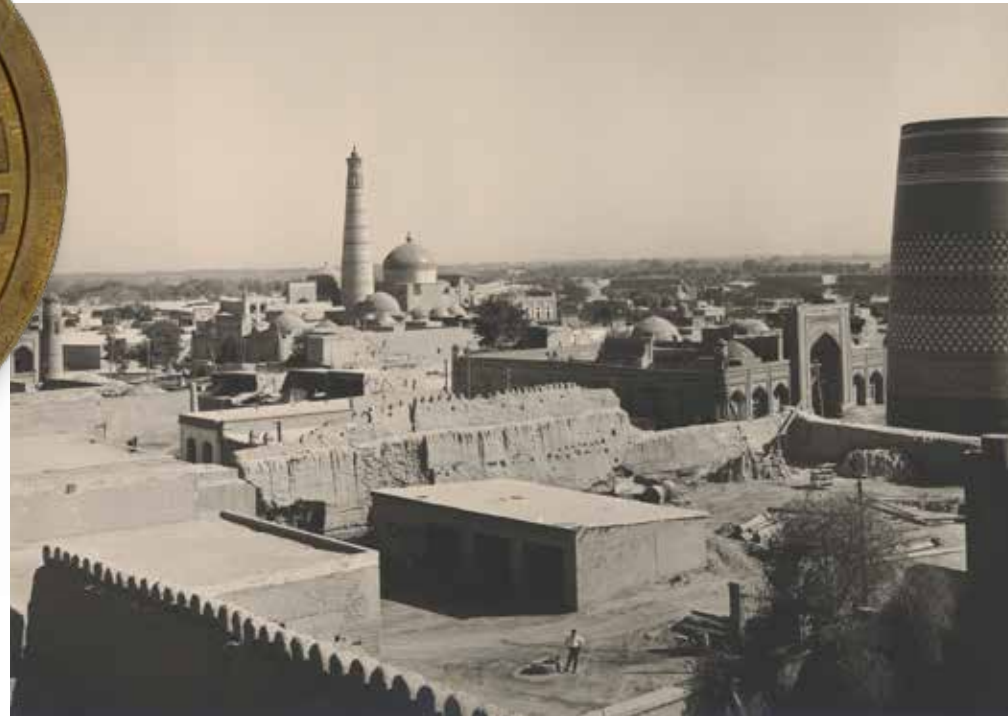
The Kalta Minor Minaret (Uzbekistan, 1940–1950)

When the Museum of Islamic Art held its exhibition about the Safavid Empire, QNL provided maps and travelogues from explorers who had visited Iran during that era. Similarly, at the Katara Arabian Horse Festival, we opened our archives and loaned books and photographs related to equestrianism.