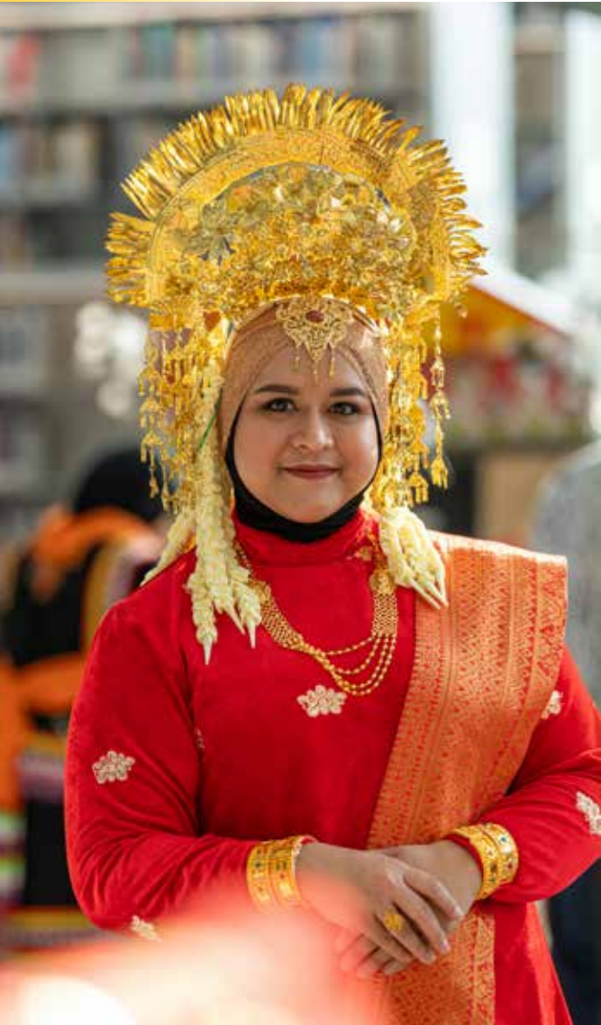
Many participants wore traditional Indonesian dress.

A weekend-long festival of Indonesian culture saw cookery demonstrations, batik-making and a talk and workshop by Indonesia’s best-selling writer, Andrea Hirata, the author of the critically acclaimed The Rainbow Troops , at events to mark the Qatar-Indonesia Year of Culture . This celebration was enriched by the vibrant stalls set up by the Indonesian community in Qatar, offering visitors a taste of Indonesia’s rich cultures and diverse traditions.