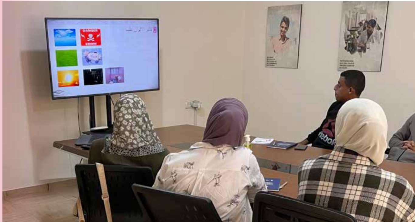
Students in Gaza attending a workshop presented by QNL online.

Lifelong learning, equity, diversity, and inclusion are enshrined in QNL's values, and we strive to embody these principles by offering training, courses, and diverse resources to people across the Middle East and beyond.