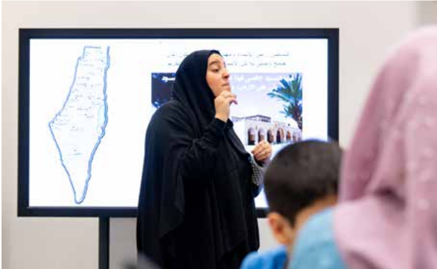
Workshops were held to teach children about the Palestinian cause.

In a commitment to raising awareness, the Children’s Library organized special events aimed at educating young people about the history and story of Palestine, while a specifically designed activation for teenagers provided an in-depth look at Palestinian cities. This activity not only educated them about the geographical and cultural landscape of Palestine but also encouraged them to create their own map of Palestine in a gesture of solidarity with its people.