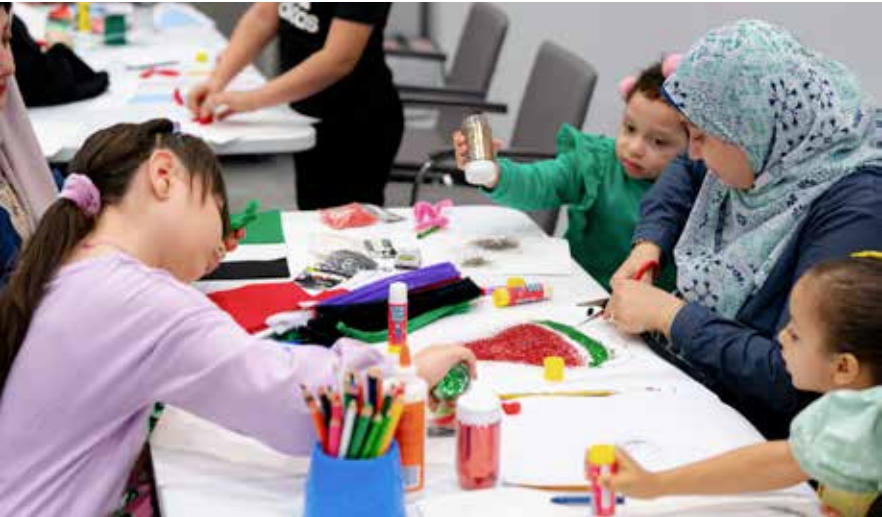
The Library has helped teach children about the Palestinian cause and the war in Gaza.