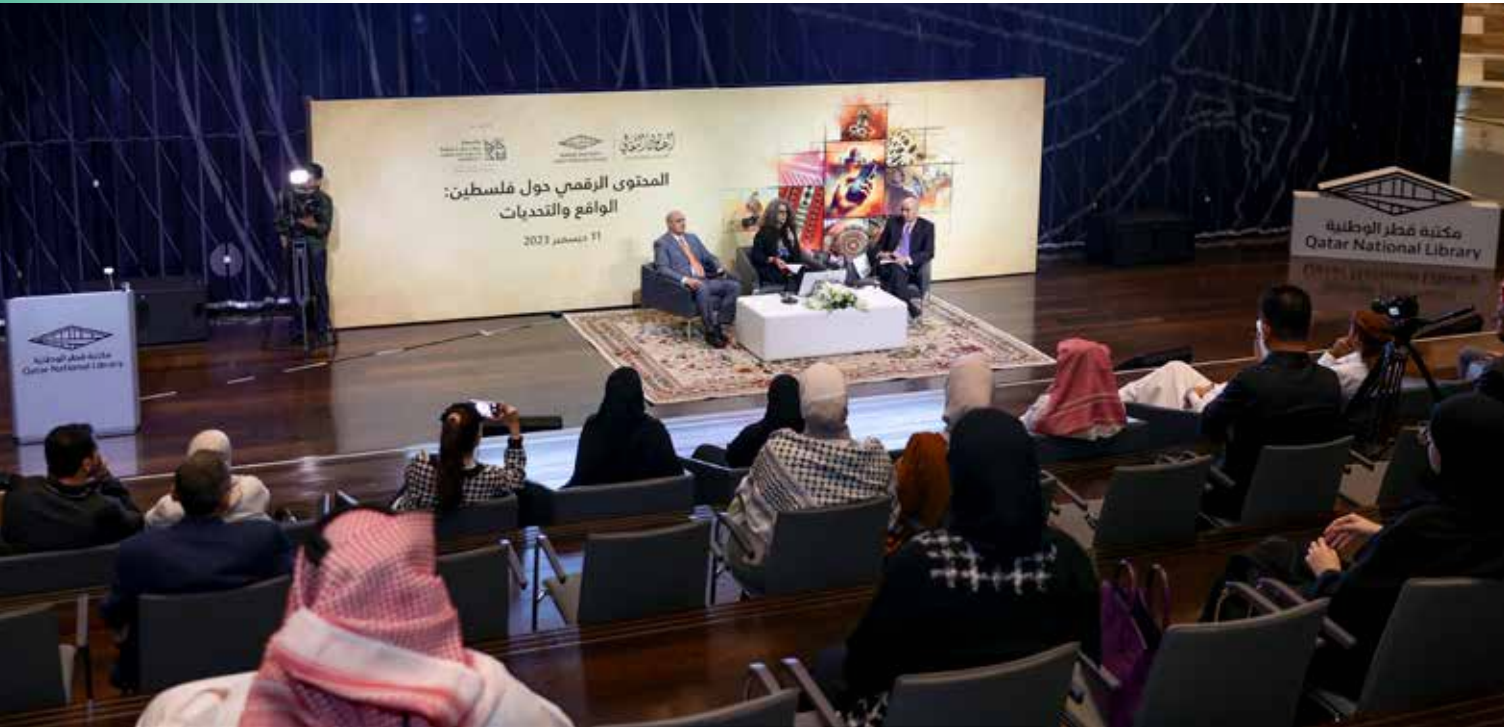
QNL’s Cultural Salon initiative examined the portrayal of Palestine in the online world.

As the world watched with horror at the unfolding human tragedy in Palestine, Qatar National Library continued to reiterate its support for Gaza and Palestine through a series of dedicated events and programs.