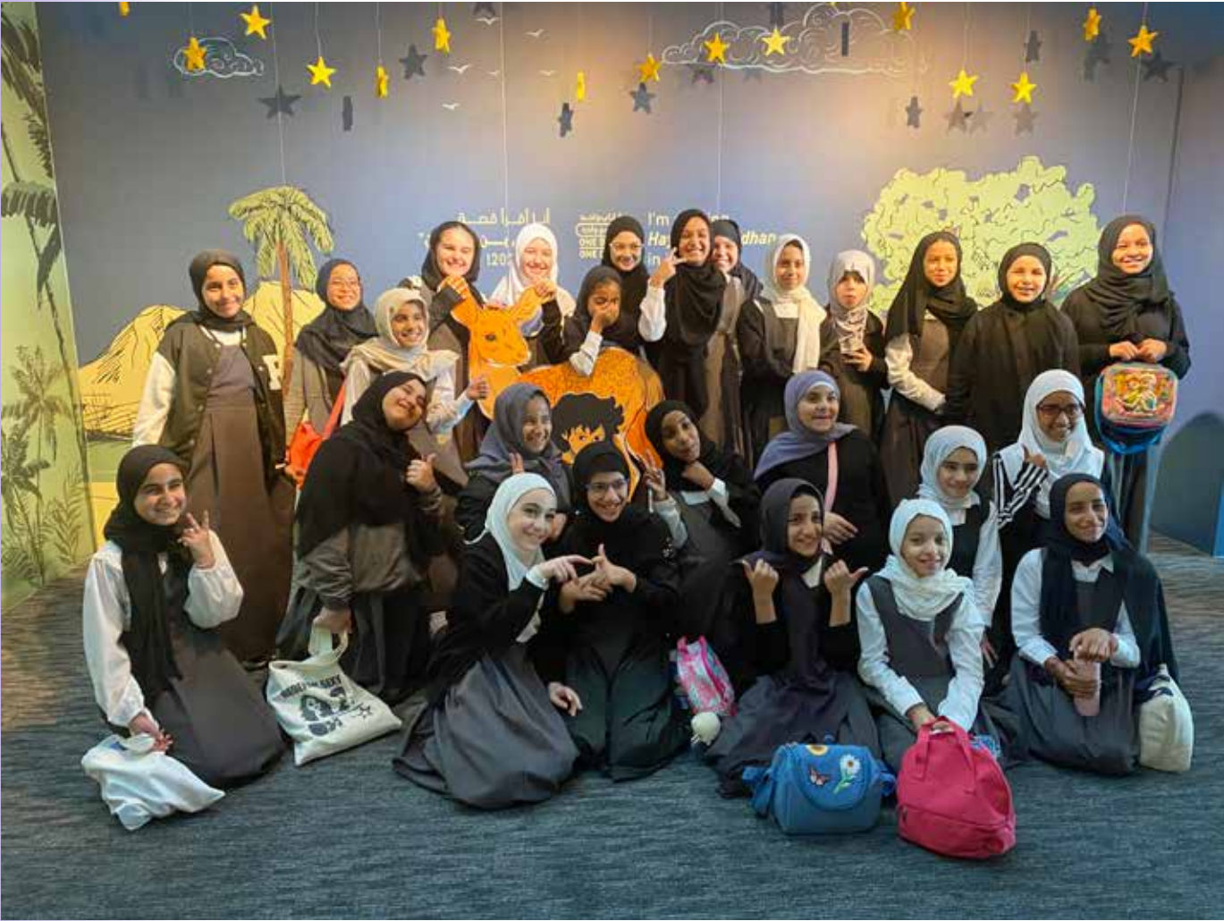
The Hayy Bin Yaqdhan exhibition was visited by hundreds of schoolchildren.

The timeless Arabic literary masterpiece Hayy Bin Yaqdhan was brought to life through Qatar Reads’ One Book, One Doha program.