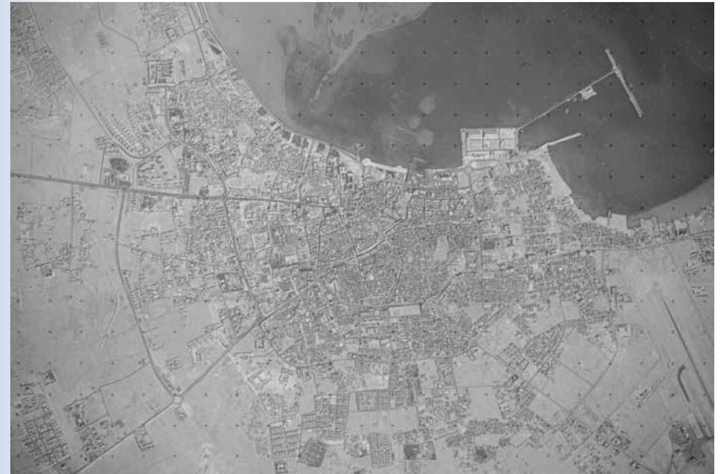
The high-resolution photography means that neighborhoods and even individual houses can be zoomed in on.

Qatar National Library has acquired almost 10,000 aerial images of Qatar taken in the 1940s and 1980s. The images were all captured in high-resolution, meaning that streets and houses – many of which may since have been demolished – can be identified.