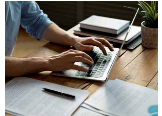
The majority of research uploaded to Manara is publicly available from anywhere in the world.

Manara was launched at the end of 2022 and aims to capture, preserve and promote all Qatar-based research outputs.