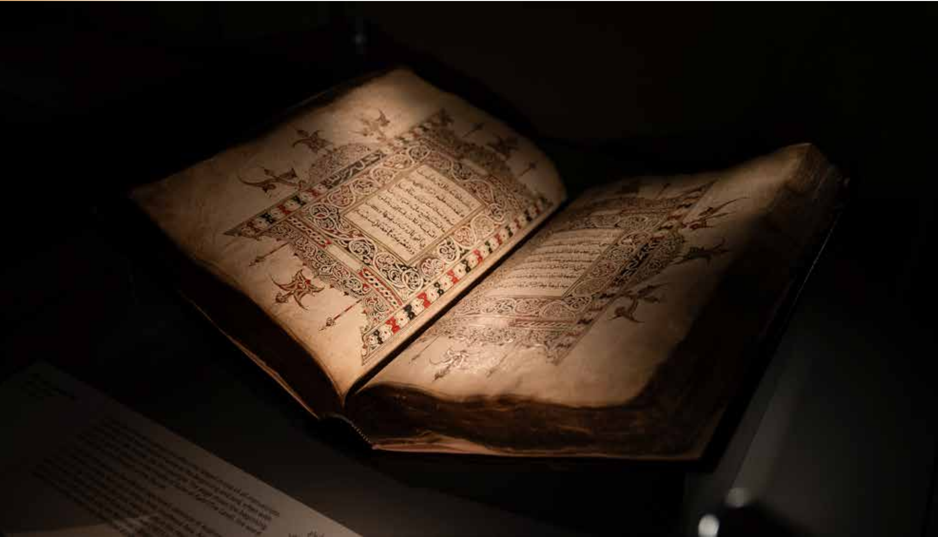
A 19th century Qur’anic manuscript from Aceh in Sumatra.

An exhibition to examine the ties that bind Indonesia and the Arab world was held as part of the Qatar-Indonesia Year of Culture celebrations. This was the Library’s first Indonesian-themed exhibition, spanning from 1 November 2023 to 25 April 2024.