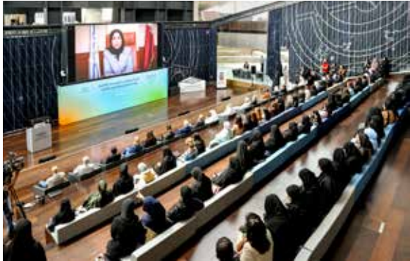
The Libraries Lead Forum discussed how libraries can shape international relations.