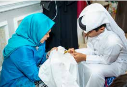
The Family Reading Program provides subscribers with a postbox for books, and holds numerous events each year.

Based on a study, an impressive 82% of children who participated in Qatar Reads’ programs, spent an increased time reading. Furthermore, 70% of parents observed a meaningful increase in the time spent reading together with their children after joining the FRP, leading to improved family dynamics, with children becoming more eloquent, confident, and engaged, underscoring the transformative power of shared reading experiences.