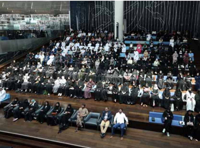
A lecture about artificial intelligence attracted a full house.