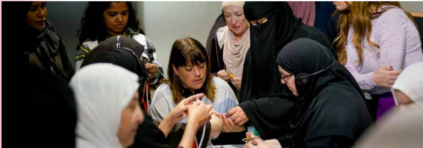
A host of activities celebrated the rich history and culture of Qatar.