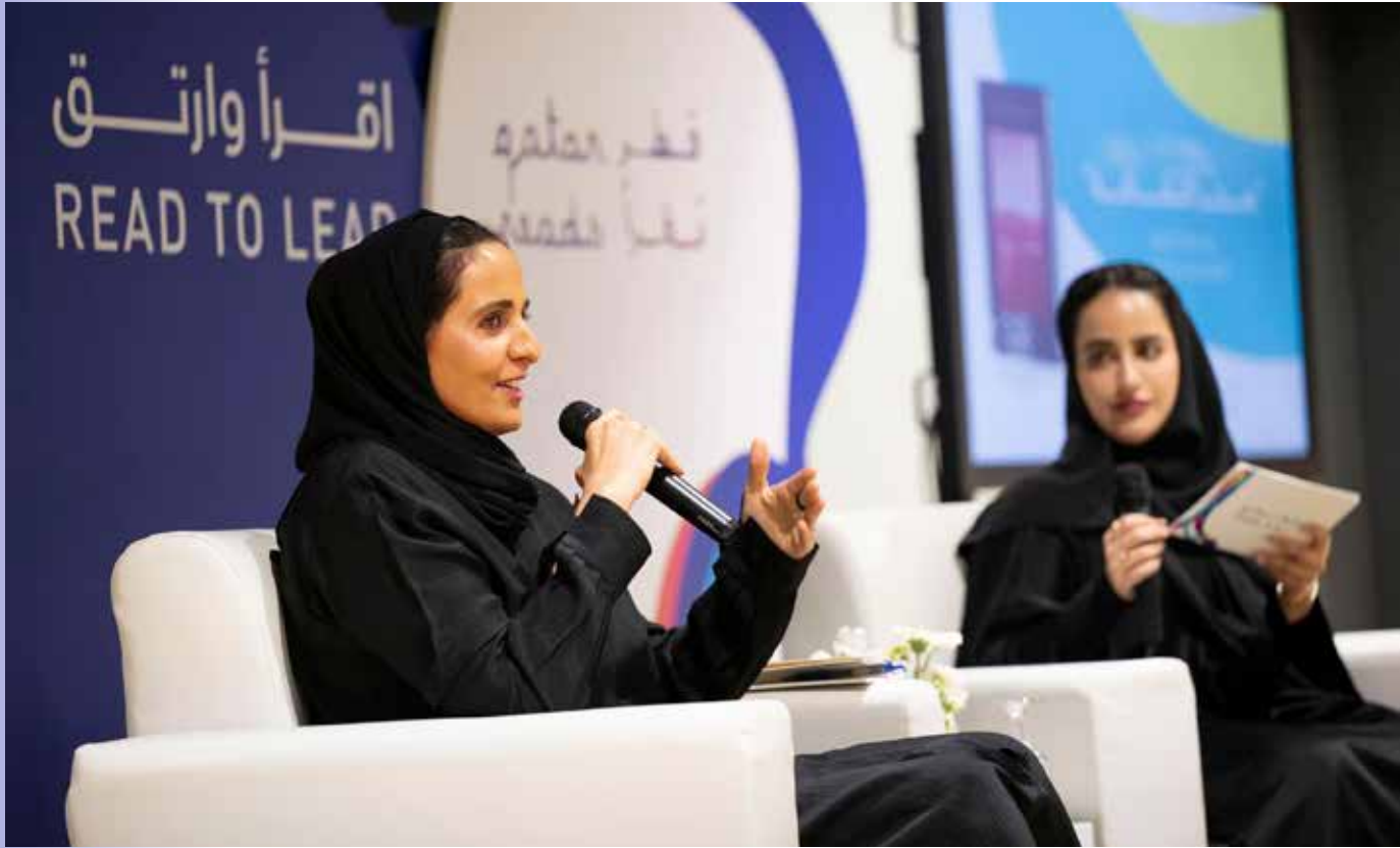
Her Excellency Sheikha Al Mayassa, the Chairperson of Qatar Museums, discussed her book, The Power of Culture .

The Power of Culture by Her Excellency Sheikha Al Mayassa bint Hamad Al Thani, the Chairperson of Qatar Museums, and the range of projects that have significantly shaped and enriched Qatar’s cultural landscape and creative economy, were discussed at the Library’s ‘Read to Lead’ event.