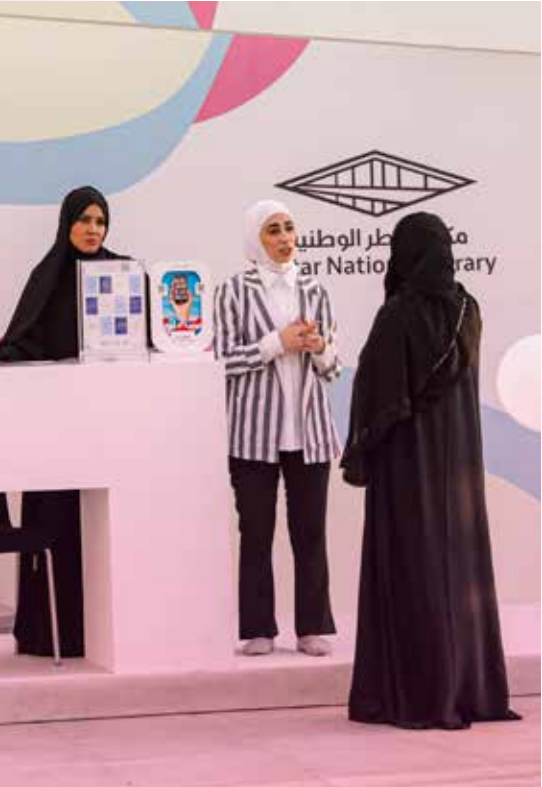
The Mommy To Be Festival featured a range of experts and attractions tailored to expectant women and families.

Pregnancy is an anxious time, both for expectant mothers and their families, so the Library’s Qatar Reads’ initiative has developed the Mommy-to-Be program to provide vital information and reassurance throughout the pregnancy journey as well as advice for new parents navigating the early stages of parenthood.