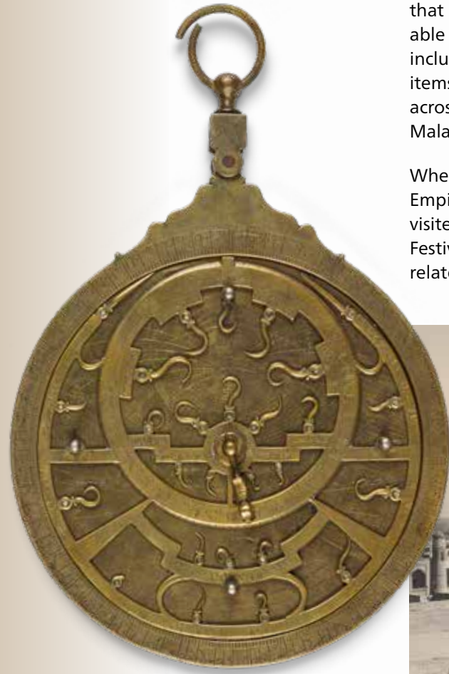
Maghrib Astrolabe (Probably Morocco, 1816 CE)

This finely-engraved astrolabe, loaned to the Jeddah Islamic Arts Biennale, is the first astrolabe to be associated with the Marsil al-Andalus family working in, probably, Morocco during the late 18th/early 19th centuries. It indicates the continued interest in astronomy and technical competence in the Maghrib circa 1800 CE.