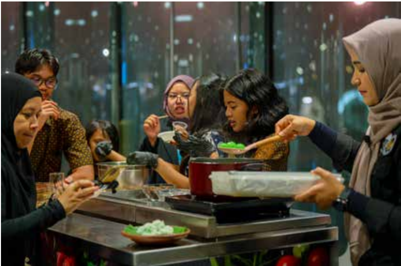
Indonesian food was served as part of the celebrations.