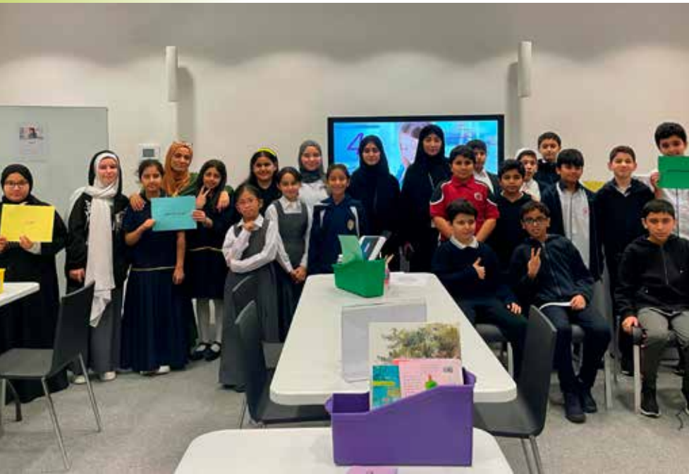
School tours ensure that young people know about the resources that QNL can offer them.

Lifelong education is at the heart of everything that Qatar National Library does, so it is no surprise that we have strong relationships with schools and programs for children of all ages.