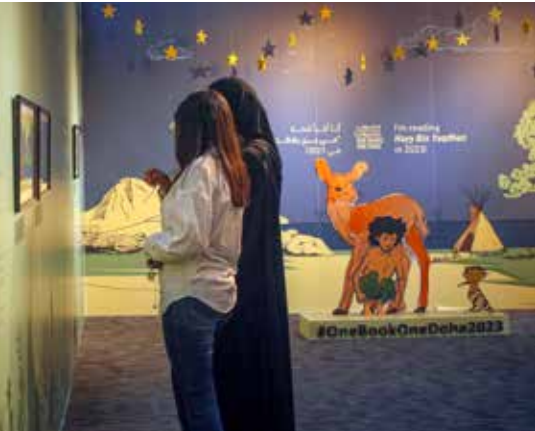
The One Book, One Doha campaign incorporated a range of different events and activities.