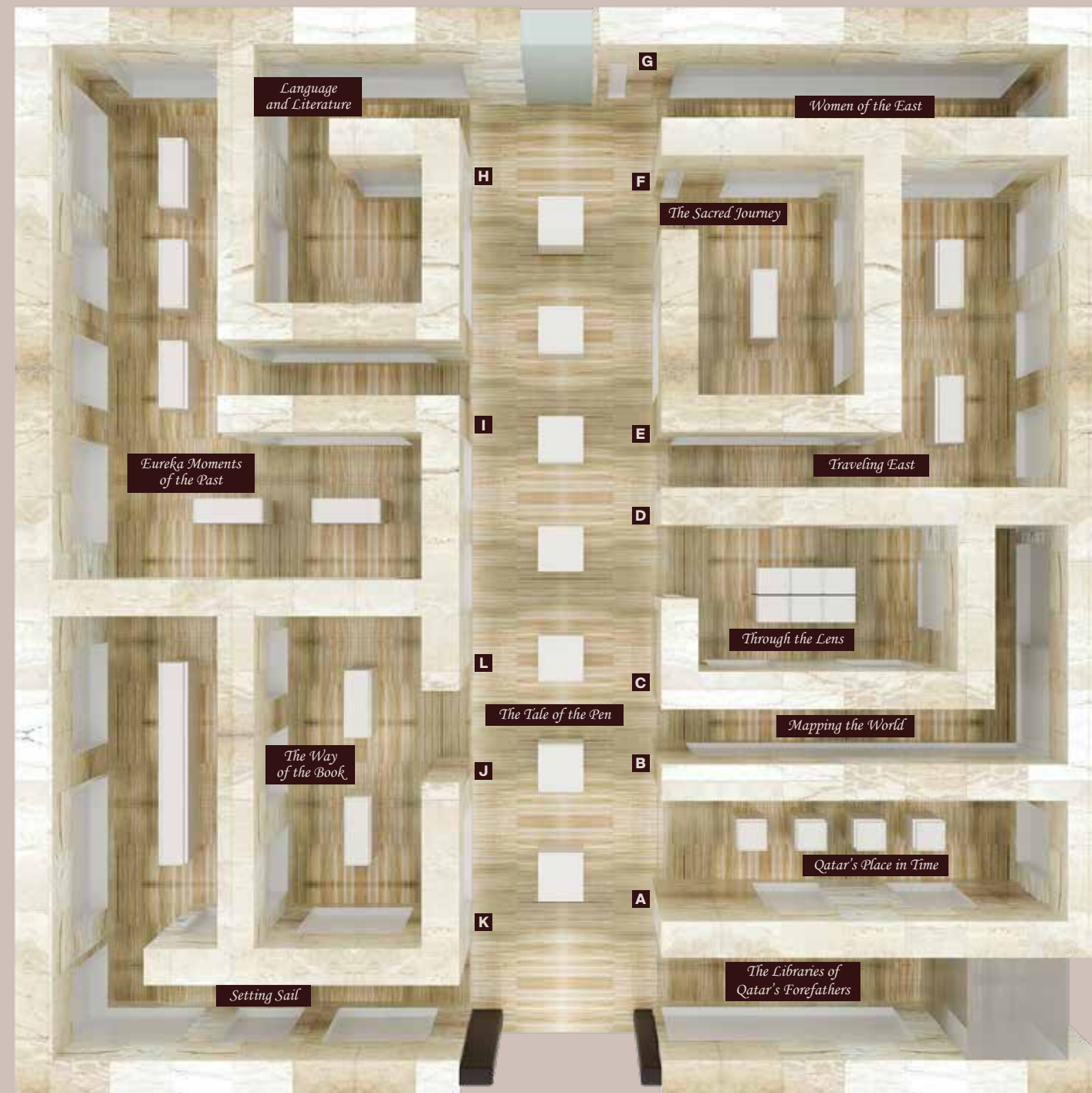
Map of the Permanent Exhibition Area

The Heritage Library Permanent Exhibition, "It All Began with 'Read'", displays more than 400 of the rarest and most valuable items from our Heritage Library collections. It reflects the uniqueness of Arab and Islamic culture, the interactions between the East and the West, and the deep history of the State of Qatar and its relationships with the rest of the world. The Permanent Exhibition is organized in 12 sections.